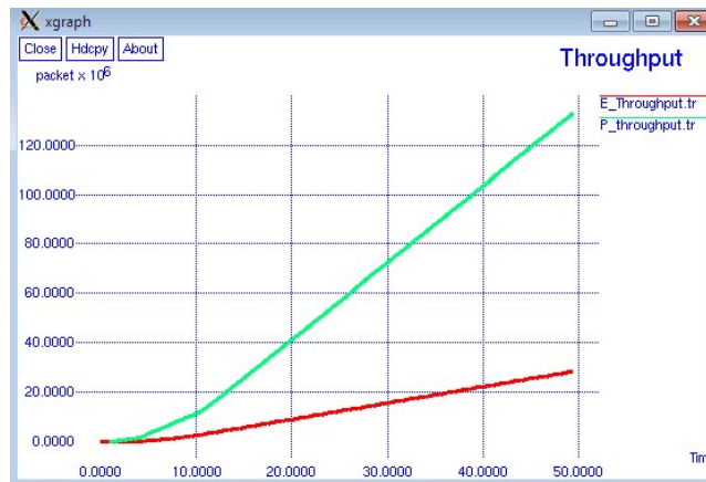
FIG. 4.2. Throughput