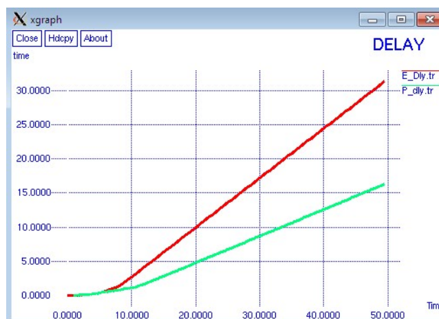
FIG. 4.3. Delay